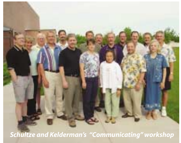
Schultze and Kelderman's "Communicating" workshop