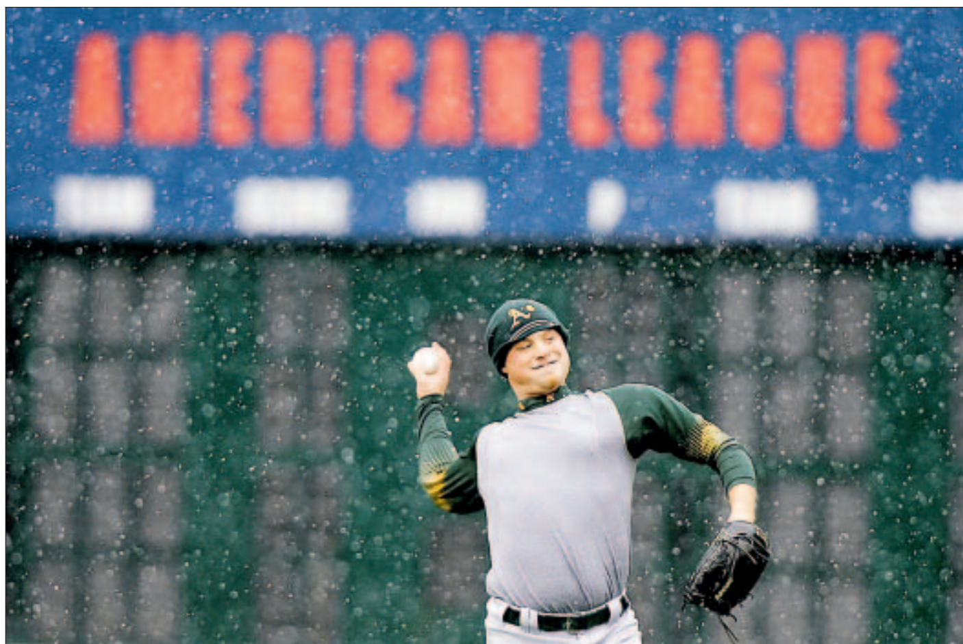
Snow ball: Oakland Athletics pitcher Chad Gaudin works out Thursday during snow flurries at Comerica Park in Detroit.