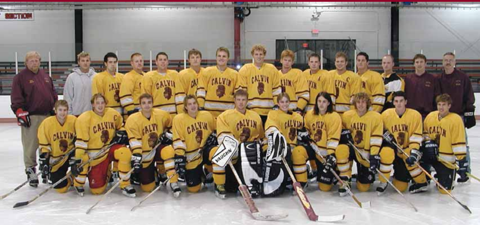
The 2003-04 Calvin College Men's Hockey Team thanks you for supporting them in their run for the national title.