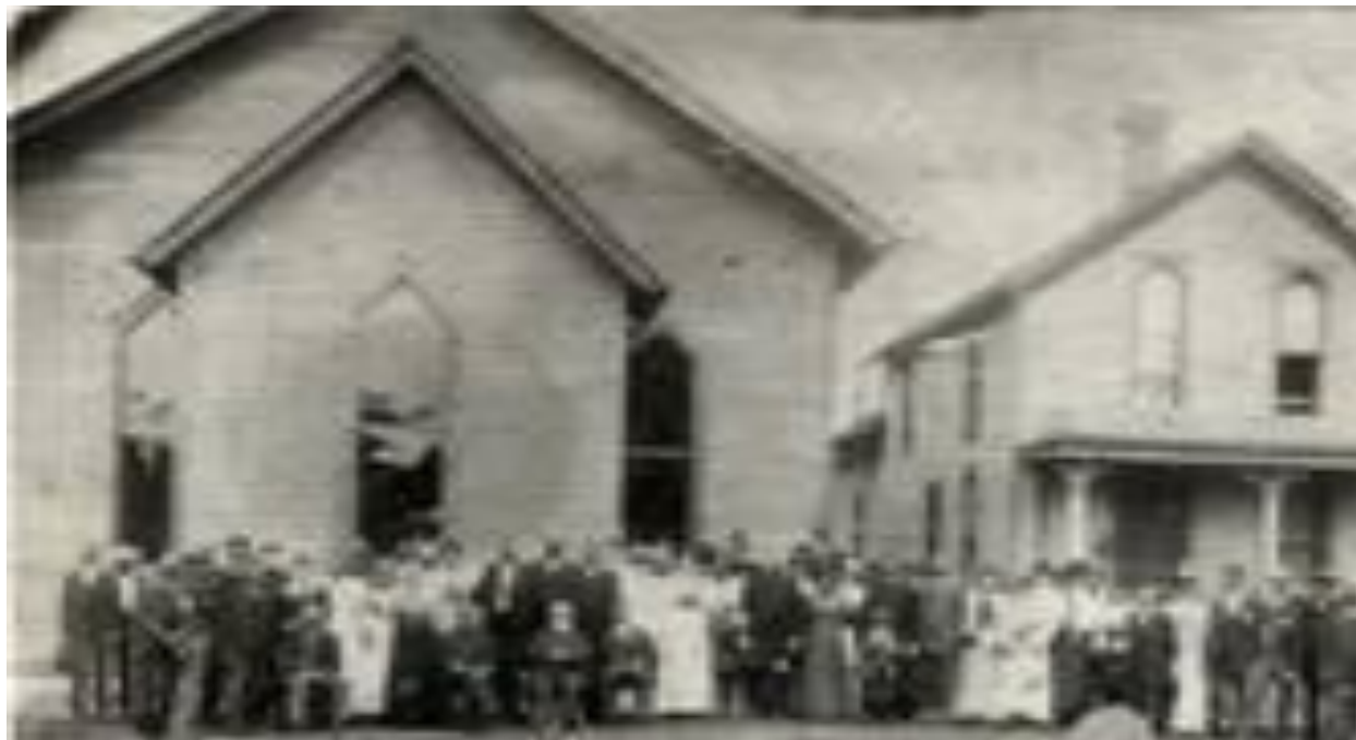
Quinn Chapel AME Church of Flint, 1897