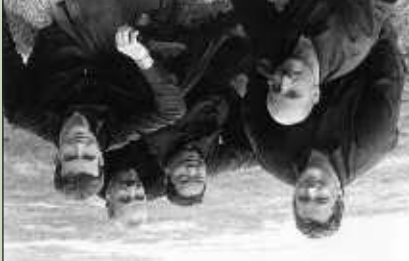
The Atlantic Brass Quintet*

Jitro, meaning "daybreak" in Czech, is based in Hradec Kralove, in the Czech Republic. Only 25-50 out of the 500 girls in seven preparatory ensembles qualify to tour. For 35 years they have been admired all over the world for their tone, intonation, and rich blend of sound and vitality. Considered one of the best children's choirs in the world, Jitro has performed at prestigious European contests in over 100 appearances annually. Jitro has recorded 18 CDs on such labels as BMA, Classics, and Amabile. In 2003 Jitro won six gold medals from the International Song Festival in Olomouc, Czech Republic and three gold medals and a silver medal from the 2006 World Choir Games in Xiamen, China in July 2006. Artistic director and conductor Professor Jiri Skopal, Ph.D. has been associated with Jitro since 1977. Skopal is a teacher, professor, and head of the Department of Music at the University of Hradec Kralove. He has published essays and choir education textbooks, and is the recipient of numerous awards and honors.