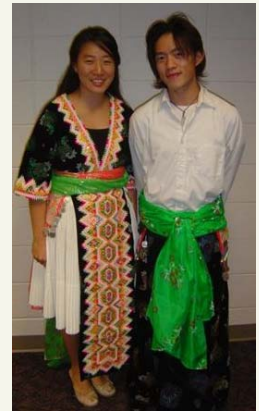
Students at the Hmong New Year Celebration in November