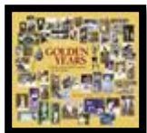
Golden Years: Calvin's First Half-Century in the MIAA, 1953-2003 A history of Calvin athletics from 1953-2003 (2005)