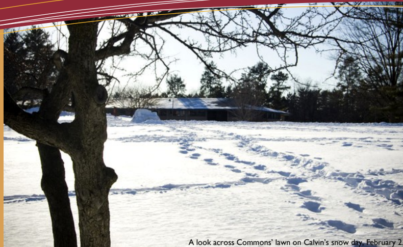
A look across Commons' lawn on Calvin's snow day, February 2.

Do you have questions about this benefit? Please feel free to contact our office at ext. 6-6495.