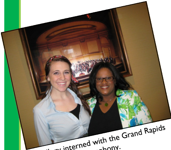
Mallory interned with the Grand Rapids Symphony.

294 Calvin students reported having a spring internship. The total number of internships that Calvin students were involved in for the 2011-2012 academic year was 861, which represents a 5% increase over last year.