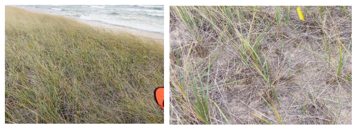
Figure 5. Vegetated foredune.

Table 4. Levels of deer impact observed for specific dune areas across 3 site visits.