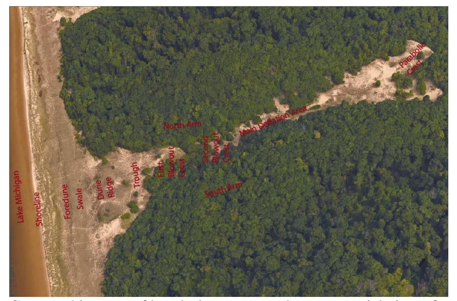
Figure 2. Geomorphic areas of beach-dune system shown on aerial view of study area.