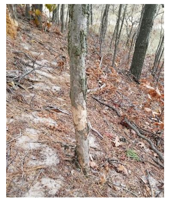
Figure 7. Tree missing bark due to deer scraping antlers.