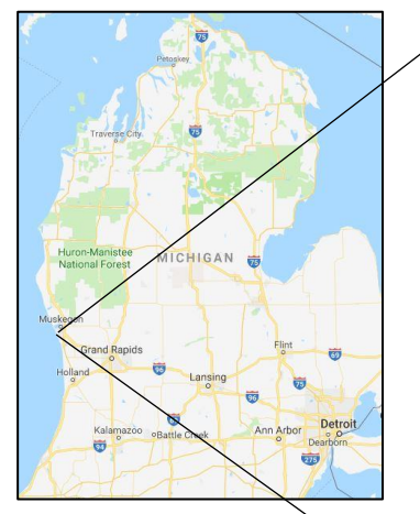
Figure 1. Location and oblique aerial view of Dune 2 in P.J. Hoffmaster State Park, Muskegon, Michigan.

is the relatively open (not forested) midsection of the windward slope of the parabolic dune.