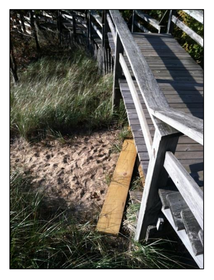
Figure 8: Unmanaged trail entry point, with leftover construction material visible.

the dune surface could be used if they are long enough. However, mesh similar to what is present on the Dune Climb would be more effective and more durable than horizontal wood boards.