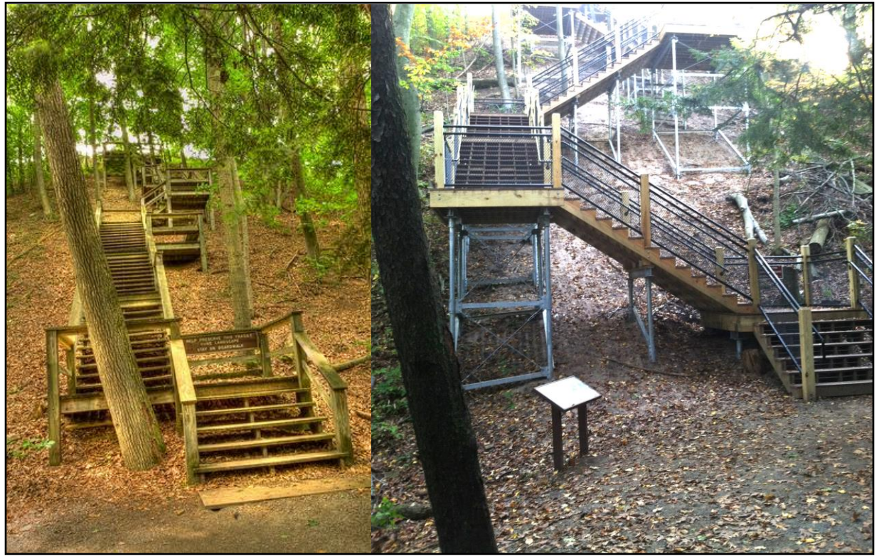
Figure 5: Old boardwalk (left) and new boardwalk (right). Note the changes in tree cover, with cut trees visible to the right in the photograph of the new boardwalk.