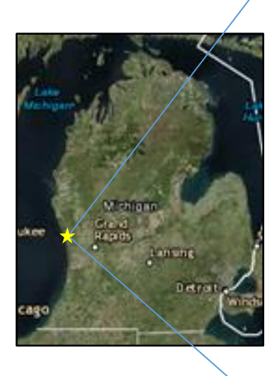
Figure 1: Location of P.J. Hoffmaster State Park in Michigan. The boardwalk location is circled on the aerial image of the park.