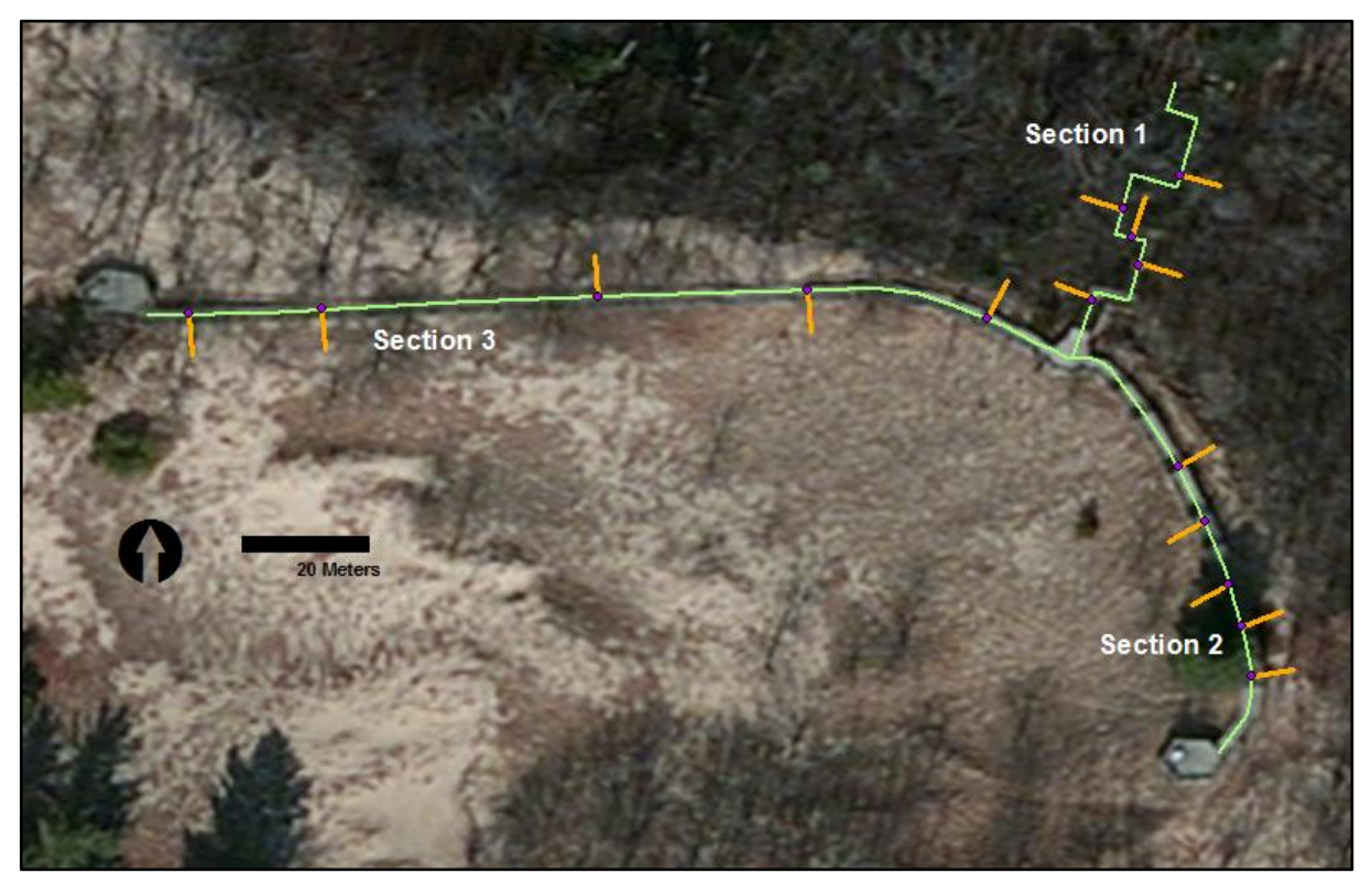
Figure 3: Transects (orange) extending from randomly-selected locations along the boardwalk.

To measure vegetation characteristics, transects perpendicular to the boardwalk were established at randomly-selected locations along the boardwalk (Figure 3). We entered the boardwalk length, in meters, into a random number generator to choose five distances from the center viewing platform at which to place transects. For example, section 3 of the boardwalk is 89 meters long, so we used the random number generator to choose 5 numbers between 1 and 89.