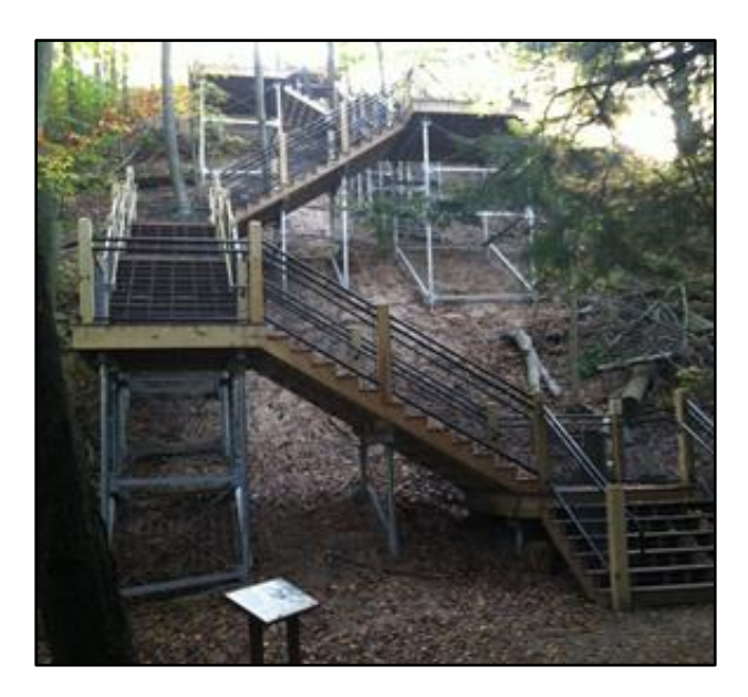
Figure 2: The Dune Climb boardwalk section after rebuilding in 2016.