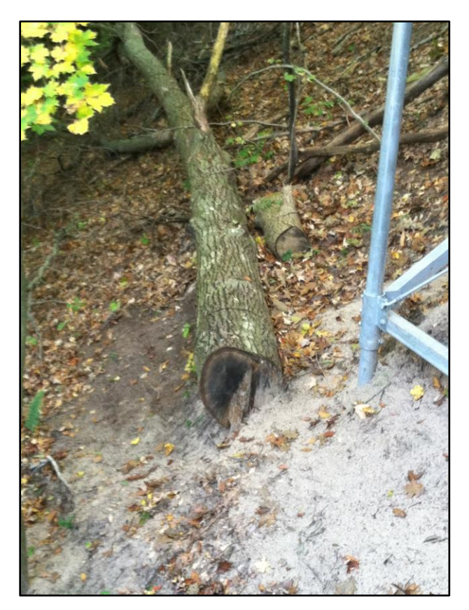
Figure 7: Recently-cut tree near new Dune Climb.