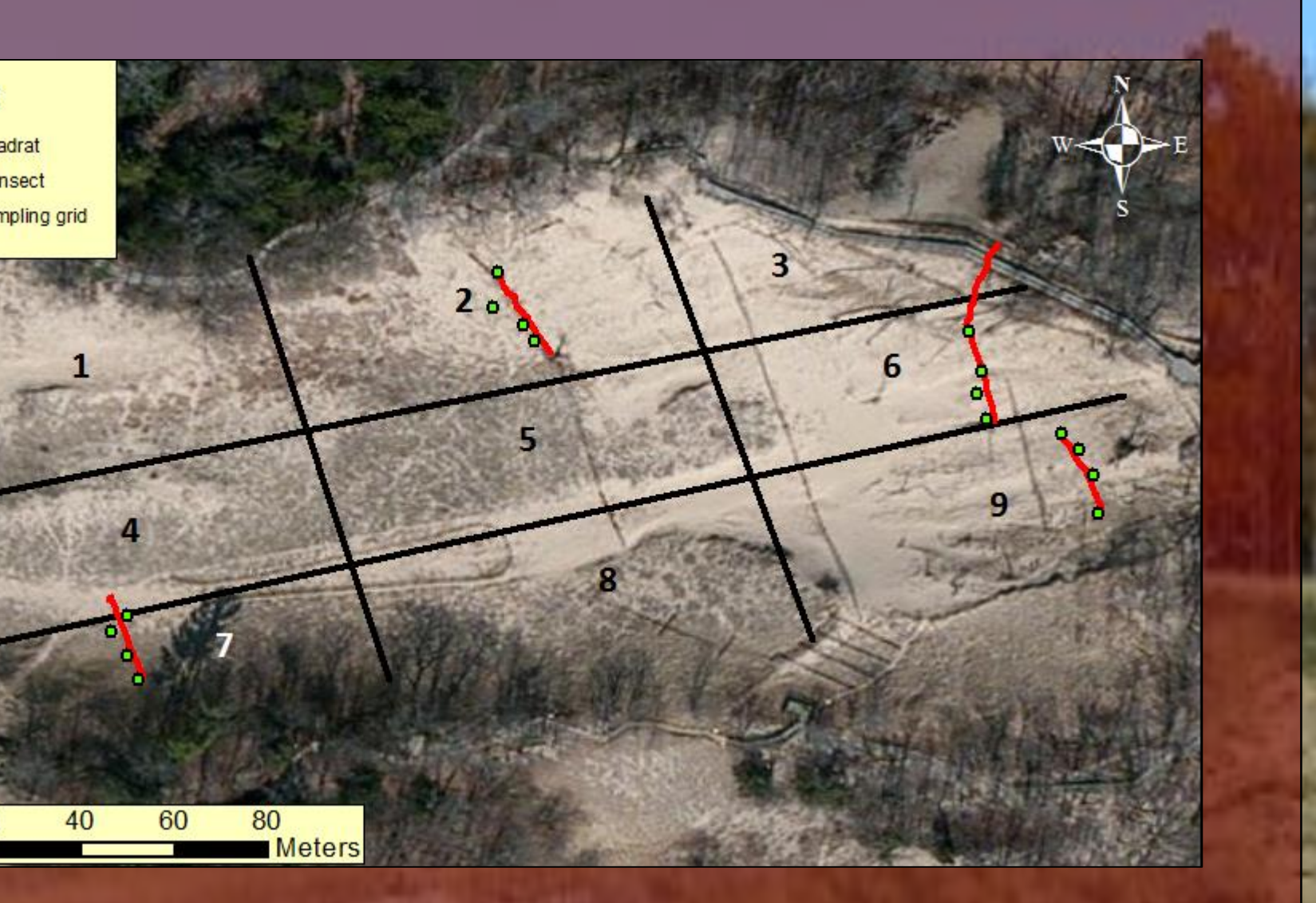
Figure 3) North Beach dune was divided into a grid of 9 squares on the windward slope and numbered by zone to allow for randomization in the data collection.