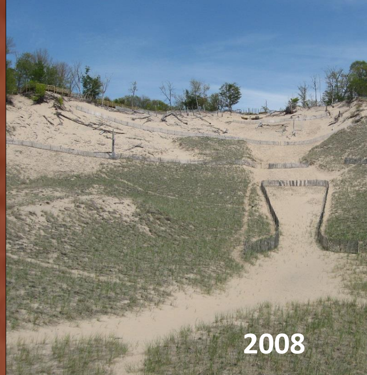
Figure 4) The vegetation cover on North Beach dune has changed from 68% in 2008 to 91% in 2016 based on ground photos. Aerial photos indicate a change from 14% in 2005 to 68% in 2014.