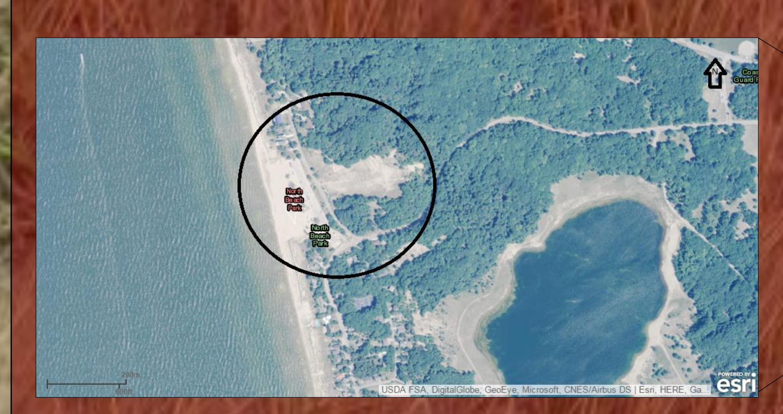
Figure 2) North Beach dune with Lake Michigan to the west. The road running south of the dune provides the only access to over 300 homes.

North Beach dune is located in Ferrysburg, Michigan (Figure 2). A 2004 study found the dune was advancing towards the only road connecting a residential area to the local town [5]. Due to this threat, extensive management efforts were implemented between 2005-2008, one of which was the planting of A. breviligulata .