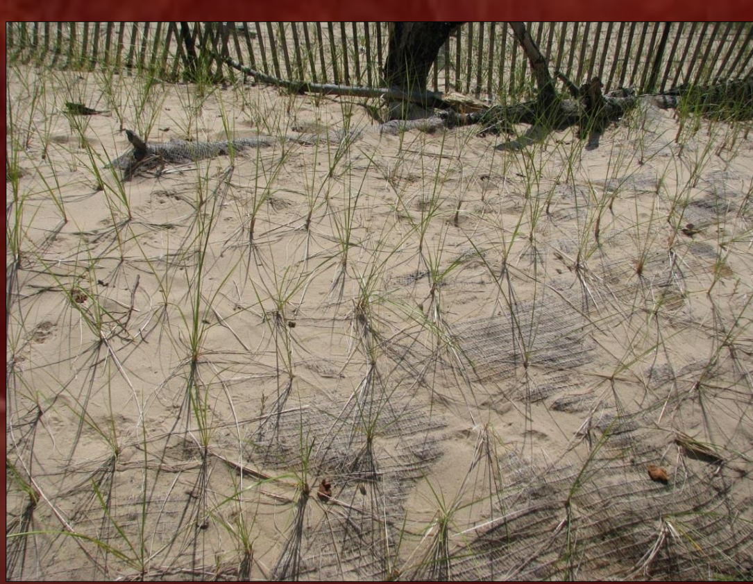
Figure 8) September 2009, planted A. brev.