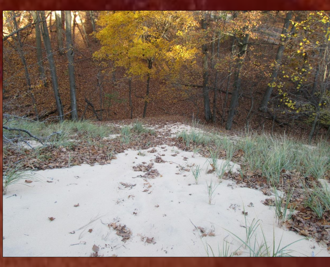
Figure 7) Leaf litter at the base of the slipface.

Although there is variability in the change in vegetation cover between aerial and ground photo measurements, the trend of the data indicates planting A. brev. on North Beach dune (figure 8) is effective at rehabilitating disturbed sites. The increased vegetation cover would slow dune advance.