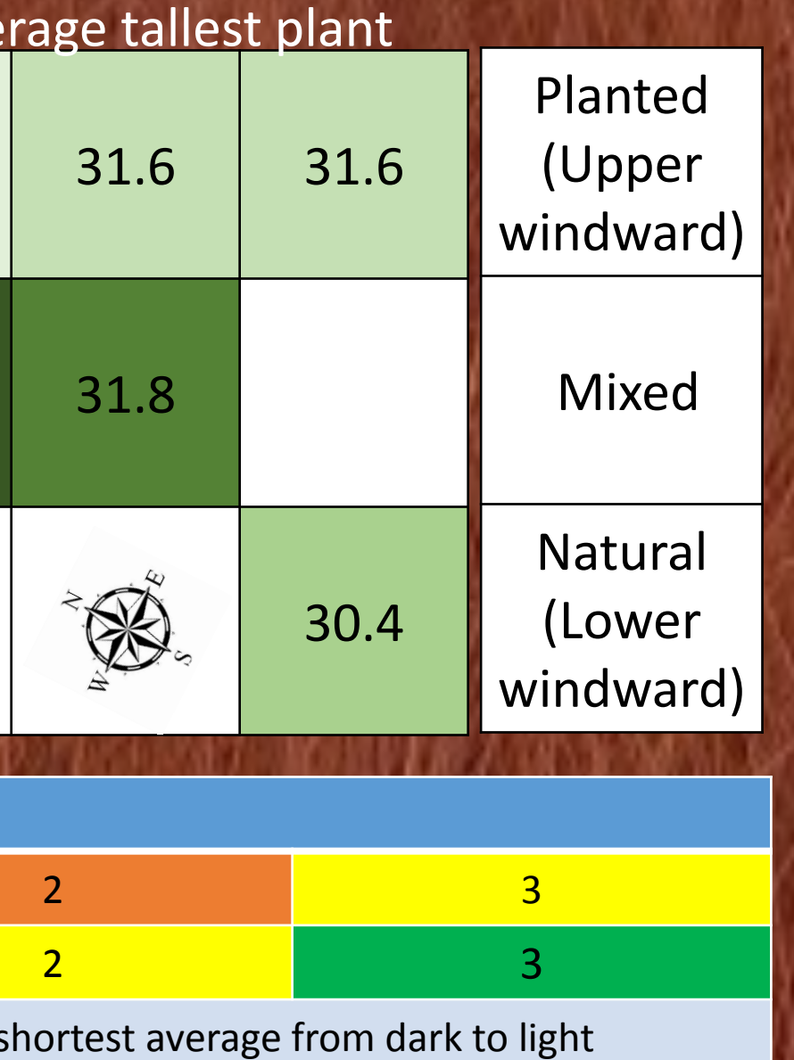
Figure 6) Distributions of plant characteristics on North Beach dune

Since planting A. brev. in 2005, the dune advance rate has decreased. Due to dune inactivity, leaf litter and surface reworking make dune position difficult to measure (Figure 7). This likely produced the variability in Figure 5.