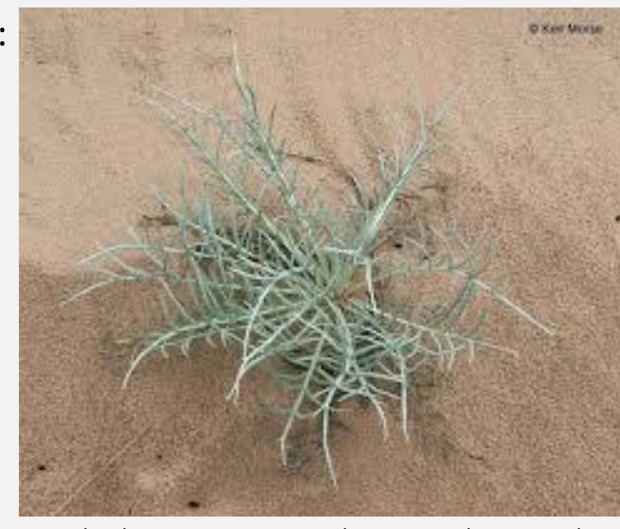
Figure 1: Cirsium pitcheri [5] is a flowering thistle species native to the Great Lakes coastal area.