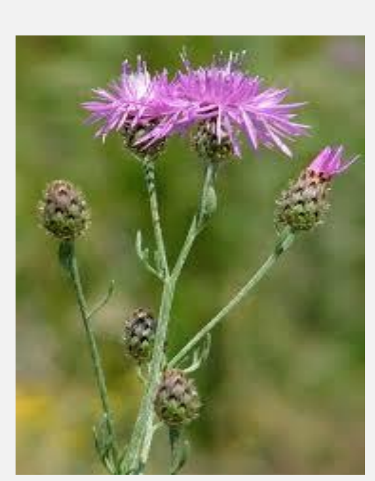
Figure 4: Spotted knapweed [6] is an invasive species to Lake Michigan coastal dunes.

The findings at North Beach Dune indicate a potential connection between sand fences and C. pitcheri populations, but no C. pitcheri was found at the physically similar Mt. Pisgah dune. This could have been due to the presence of spotted knapweed (fig. 4) at the Mt. Pisgah location inhibiting C. pitcheri , but that is only one possibility. Therefore, we recommend future investigation into the relationship between C. pitcheri and sand fences.