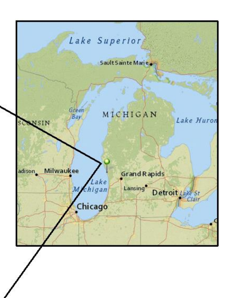
Figure 2. The study area was a dune in P.J. Hoffmaster State Park in Muskegon, MI.