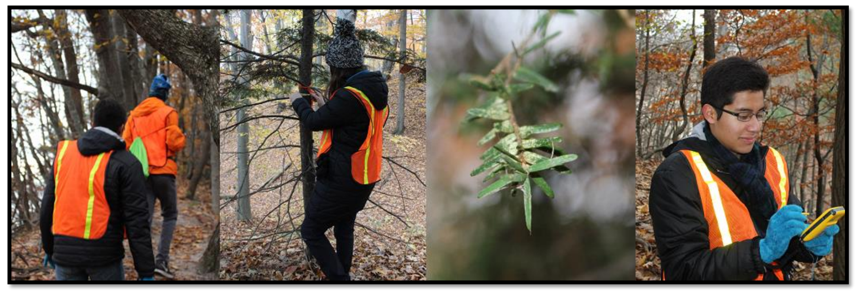
Figure 3. Hemlock data collection methods (left to right): Mapping hemlock stands. measuring tree diameters, determining HWA evidence and health, mapping individual

In order to investigate infestation, we looked for discolored needles, sparse branches, a white sticky substance on the needles, and HWA itself. We documented the potential infestation using GPS units and cameras, and we recorded health of trees in field notebooks.