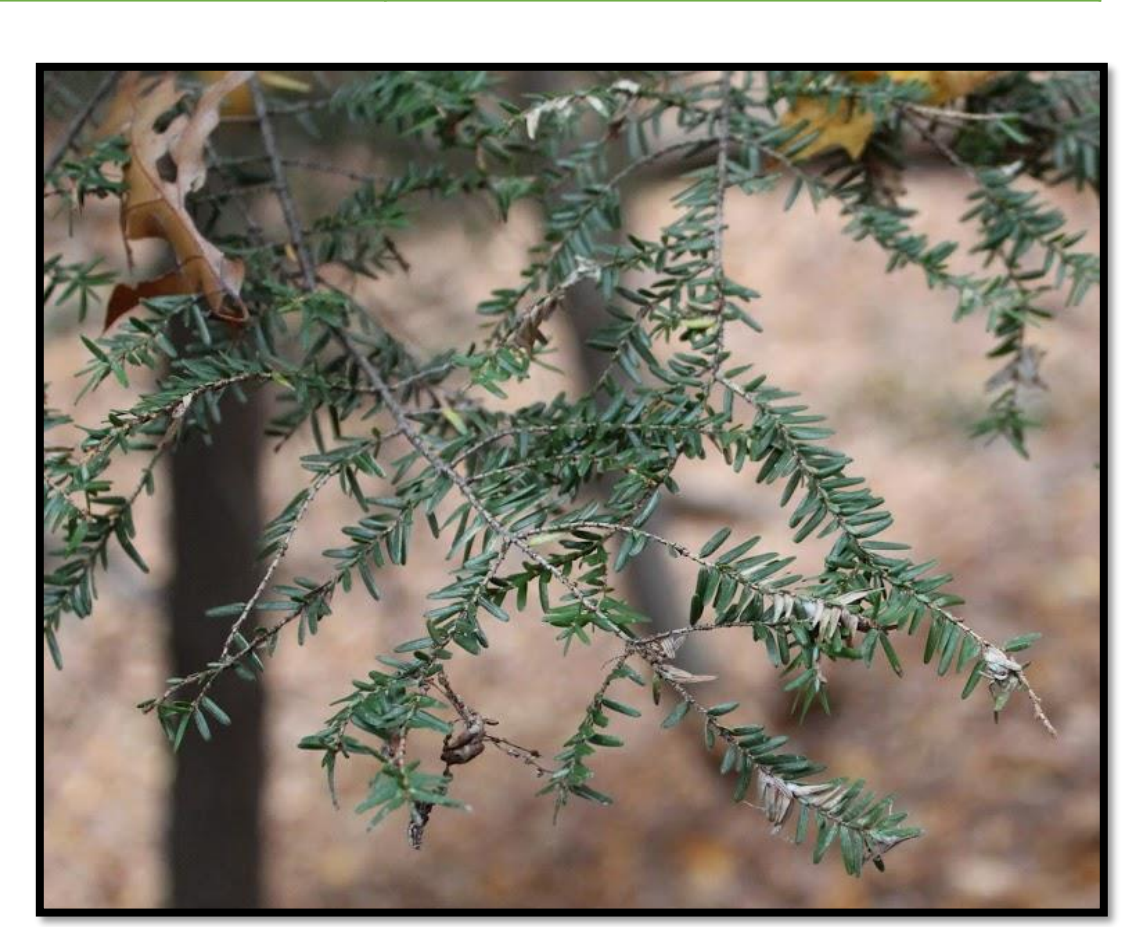
Figure 5. Discolored needles are a possible sign of HWA

Seventeen lone trees and five of the stands which we encountered were at least partially dead and appeared to be experiencing the effects of HWA (figure 5).