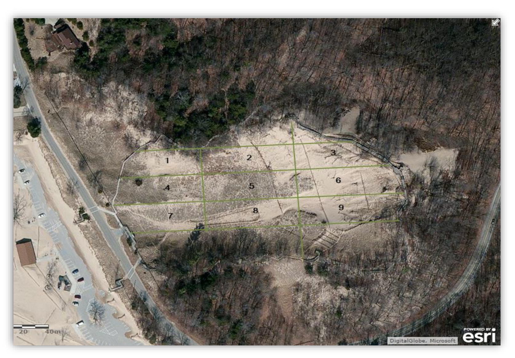
Figure E: Numbered grid on dune

We divided North Beach dune into nine different zones (Fig. E). The vegetation was naturally grown on the slipface and at the base of the dune in zones 1, 4, and 7. The vegetation was mixed, both planted and natural, in the middle of the dune around the blowout in zones 2, 5, and 8. The species A. breviligulata was completely planted in zones 3, 6, and 9 at the top in order to help stabilize the dune.