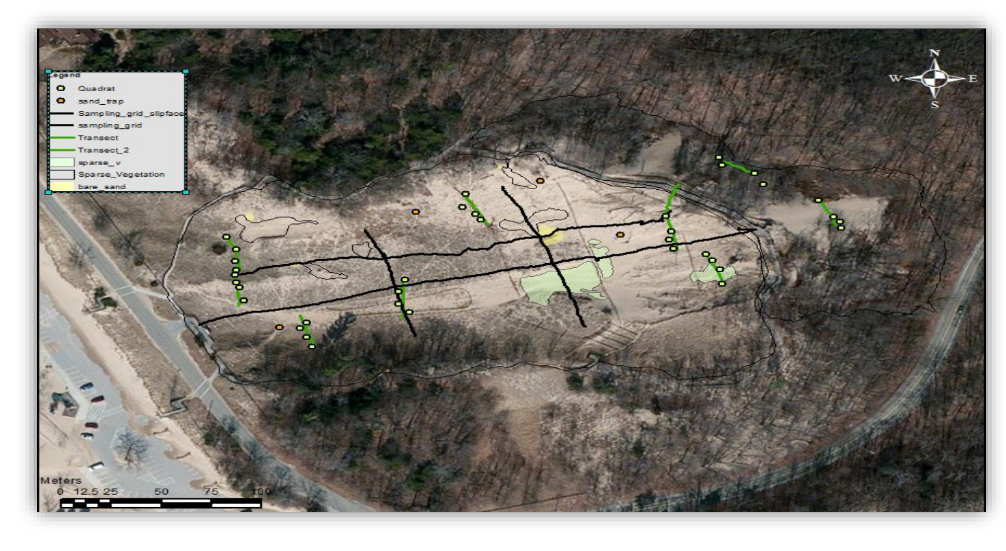
Figure D: GPS of North Beach dune, grid, and transect and quadrats

We studied the vegetation on North Beach dune to compare the planted vegetation to the natural vegetation using methods that have been used in other studies [1]. We created a numbered grid for the dune which we used to split the dune into equal sections in which to conduct our studies (Fig. D).