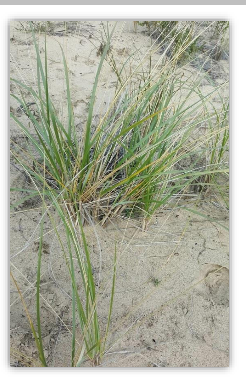
Figure A (left) and Figure B (above): Ammophila breviligulata was the most common plant found on North Beach dune. It was the only species planted for vegetation restoration