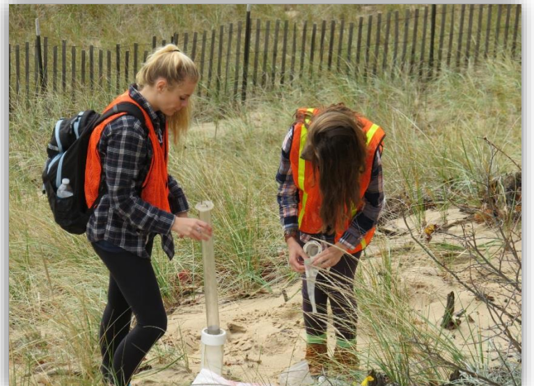
Figure H: Two team members collecting sand from sand traps

Our results, similar to other studies, reveal that the restored parts of North Beach dune lack the diversity that natural parts have [2]. The natural sections of the dune contained more moisture in the sand samples, produced more sand in their sand traps (Fig. H), and contained less height and density, but the vegetation was healthier.