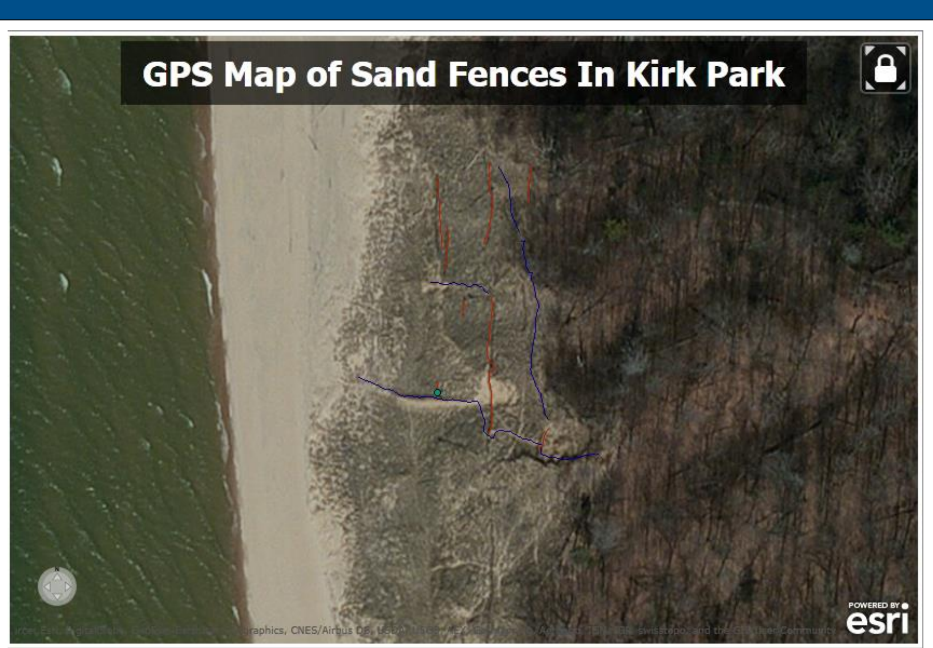
Figure 3: GPS map of the sand fences and unmanaged trails in Kirk Park. Red lines represent sand fences, purple lines represent unmanaged trails.

• Sand fences are prone to damage, affecting effectiveness. In our study we found that 50% of the fences were heavily damaged, 32% were lightly damaged, and 18% were new. 83% of all the fences observed were damaged (Fig. 4 and 5). The damage inflicted on the fences affected the porosity of the fences and the value they have in preventing human traffic. 85% of the sand fences had a porosity of