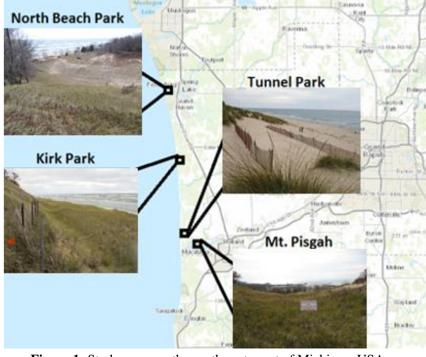
Figure 1: Study areas on the southwest coast of Michigan, USA.

We chose four Ottawa County Parks on the east shore of Lake Michigan for our study (Fig. 1).