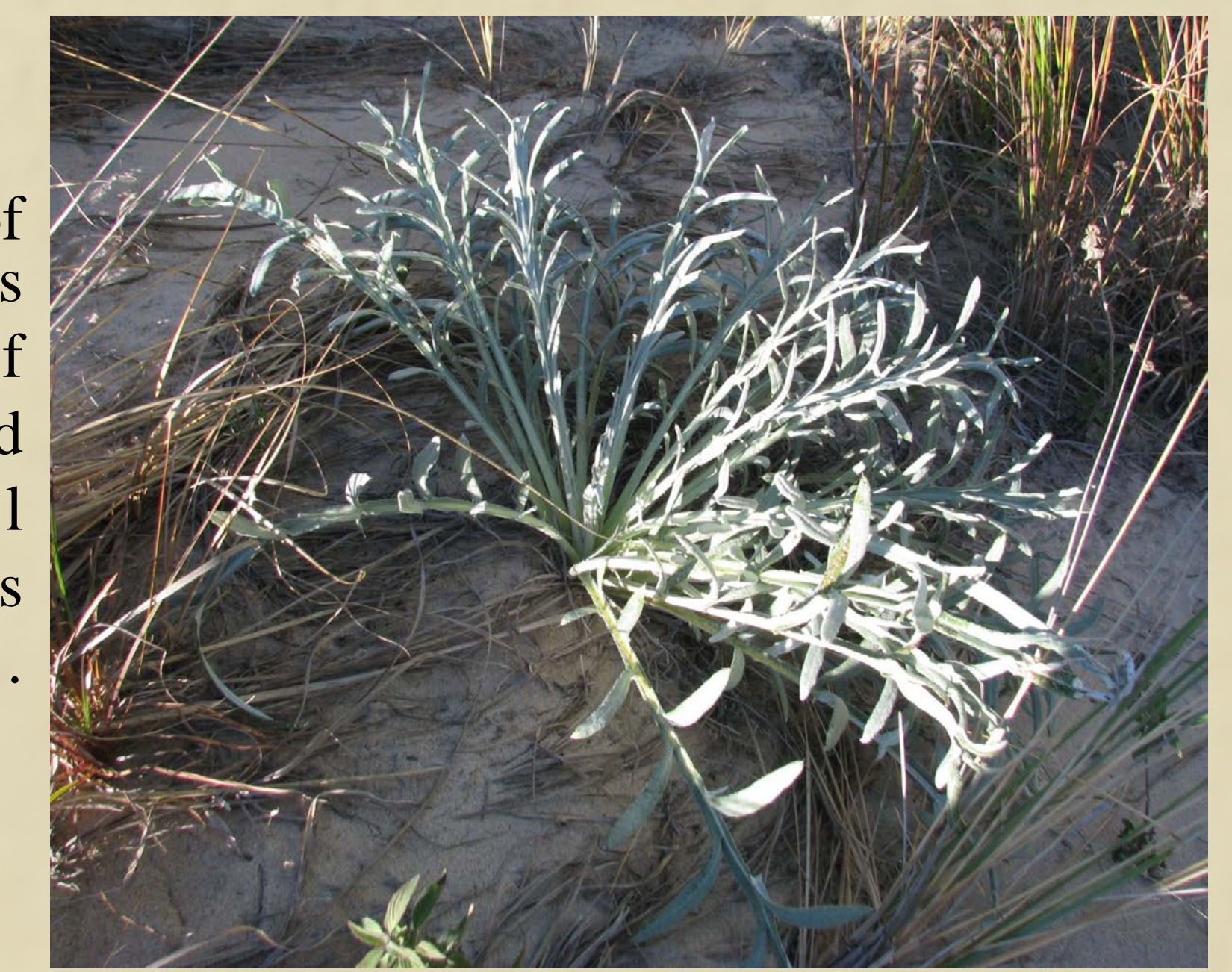
Figure 1. Pitchers Thistle is pictured here on Dune A.

-Assess the health of the Pitcher's Thistles -Produce a map of Pitcher's Thistle and unmanaged trail locations for analysis and comparison.