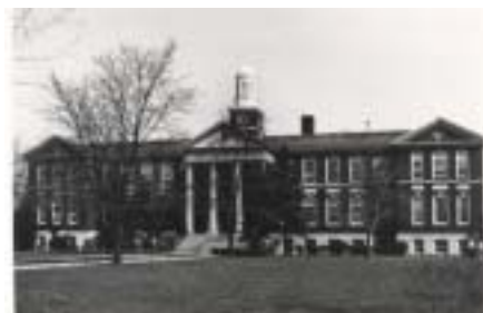
Calvin's Franklin Campus, 1917-1973

Obviously, a lot has changed since the 1930s. Calvin's student enrollment has expanded to the current level of over 4,000, the department now boasts 9 full-time professors (and one half-time), two department majors are offered (and one area of concentration), and 146 students are registered currently as Political Science department majors.