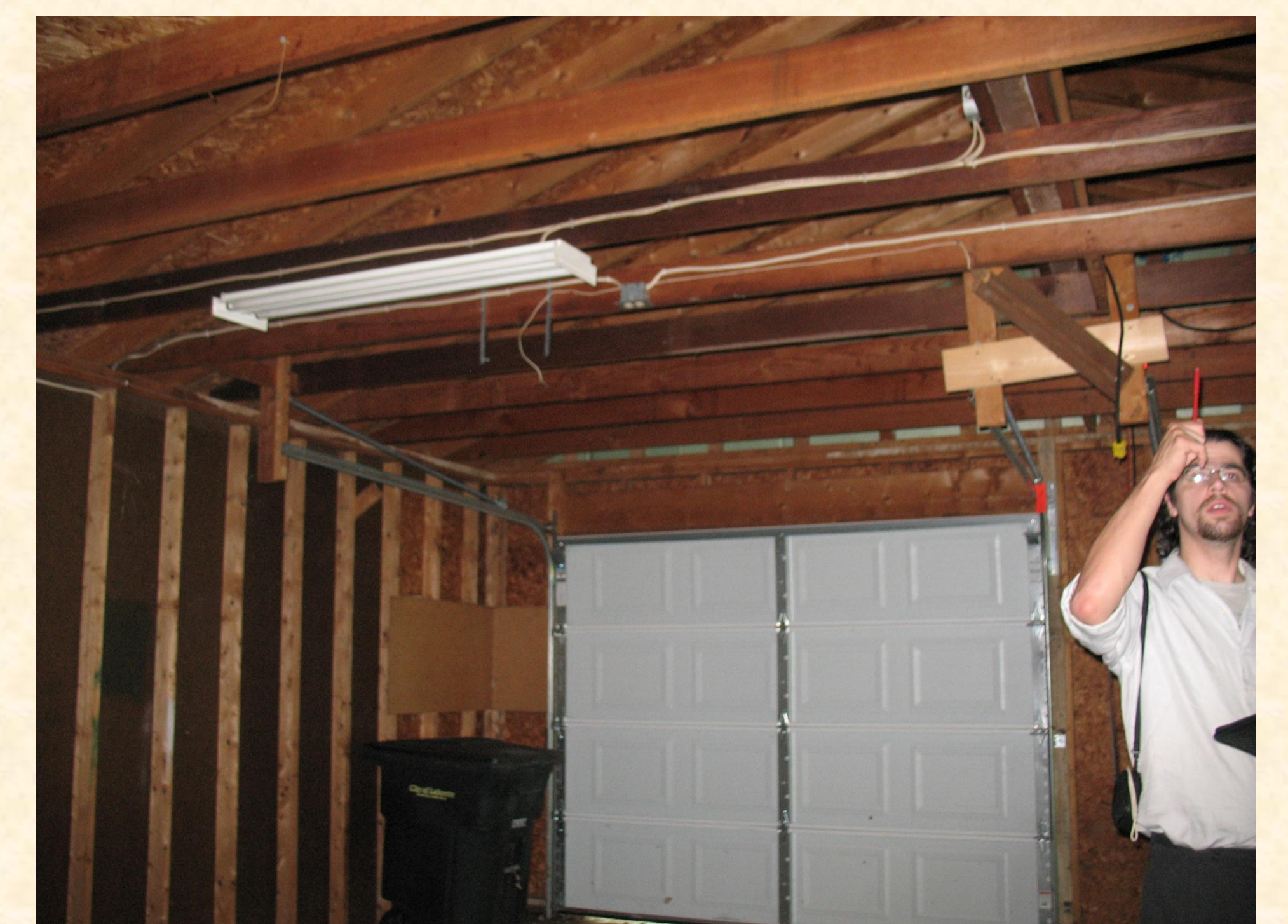
One of the project leads on a site visit