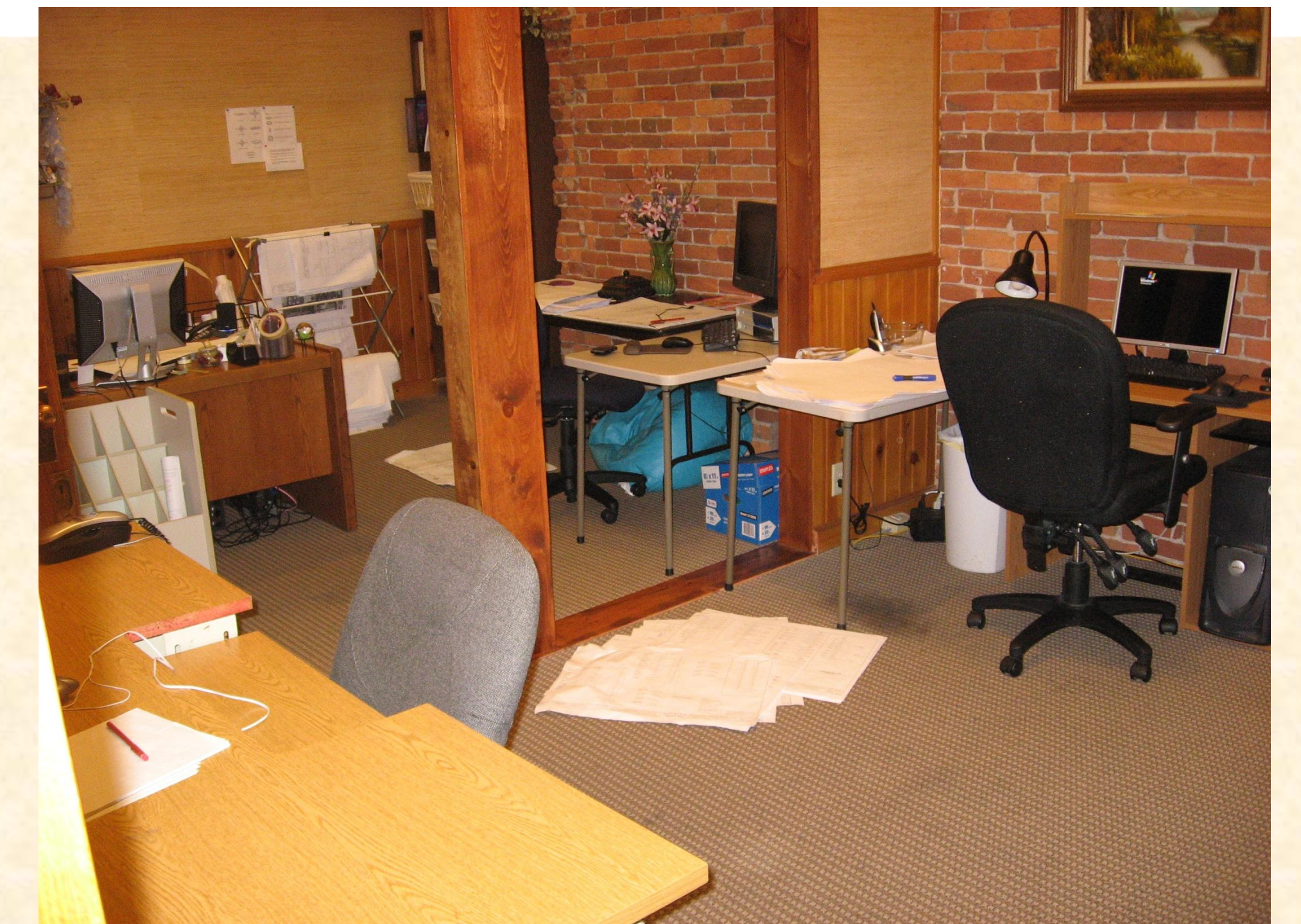
The office on a typical day – my desk is on the right.

My time at Debbie Mann Consulting has taught me quite a bit about electrical engineering in general. It has taught me even more about my natural abilities – I took to the work far better than anyone had expected. The company has expressed interest in my potential return next summer.