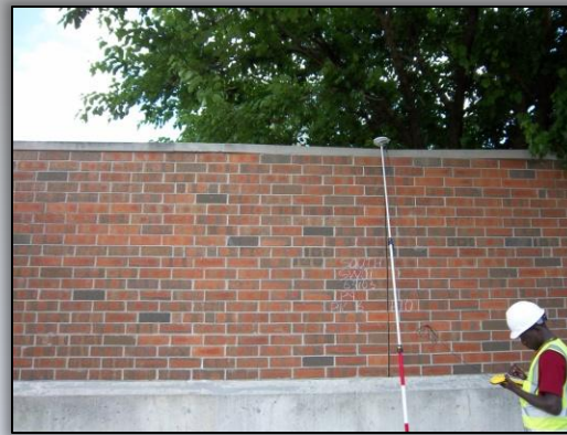
A GPS and antennae that was used to carry out the inspection