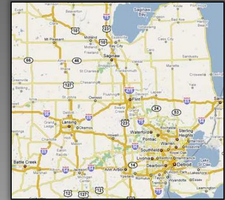
About 75% of the walls were along the highways in the Detroit area