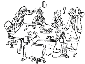
"Now see, we couldn't have this kind of fun, if we met online."